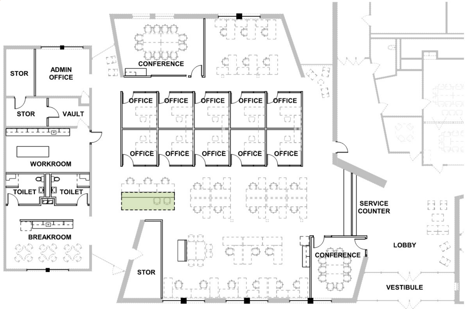
PROPOSED MAIN LEVEL PLAN – SCHEMATIC DESIGN